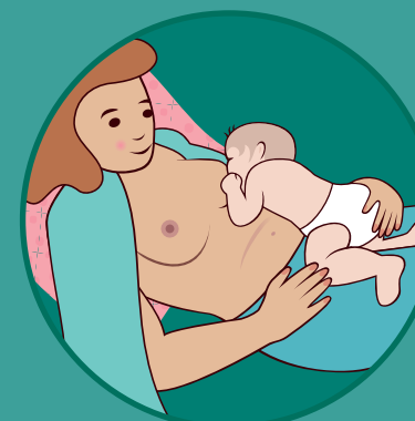
Laid back position